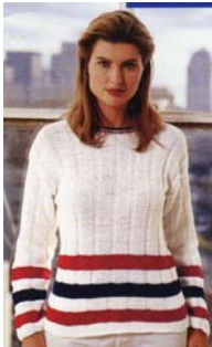
#16 STRIPED PULLOVER Beginner